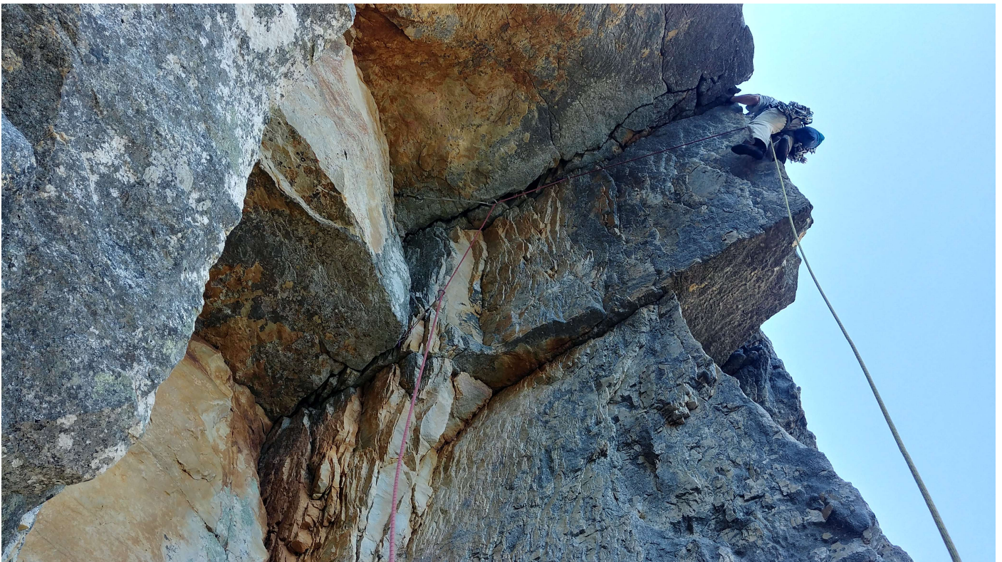
Snort leading pitch 3 on Terrific Time.